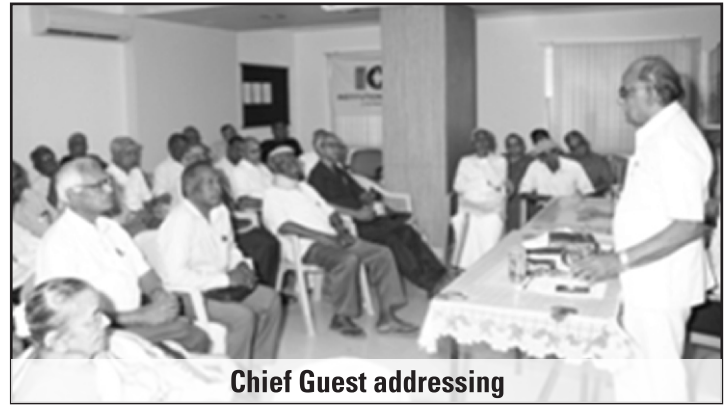
Chief Guest addressing