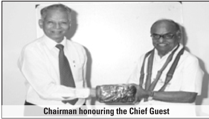
Chairman honouring the Chief Guest